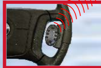
Steering wheel remote control (optional)